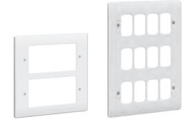
Complete range of grid front plates and modules p. 80-85