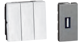
Arteor modules p. 9-29