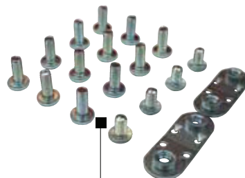
Fastener kit 2 WSTIPFIX2

Order information (p. 6) Standards and quality assessment (p. 11) Dimensions and technical information (p. 12-17)