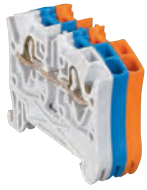
0372 60 + 0372 00 + 0372 20