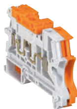
0371 84 + 0371 86