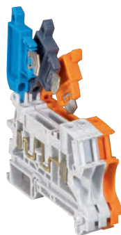
0371 82 + 0371 83 + 0371 85