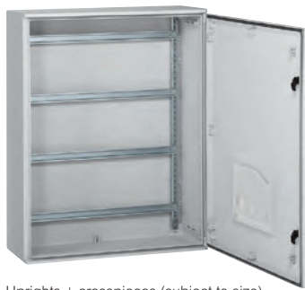
Uprights + crosspieces (subject to size) Pocket Cat. No. 0365 80

Atlantic, Atlantic stainless steel and Marina