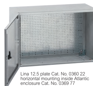
Lina 12.5 plate Cat. No. 0360 22 horizontal mounting inside Atlantic enclosure Cat. No. 0369 77

Enclosure and equipment selection chart p. 6-7 Technical characteristics p. 22