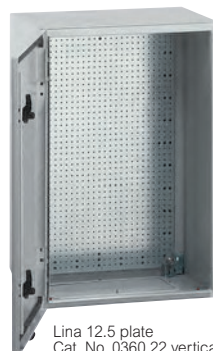
Lina 12.5 plate Cat. No. 0360 22 vertical mounting inside Atlantic enclosure Cat. No. 0369 26