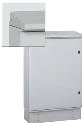
0362 63 + plinth Cat. No. 0362 92 + roof Cat. No. 0362 95