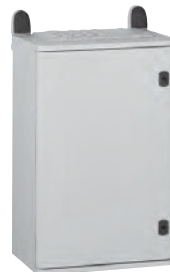
0362 55 + wall brackets Cat. No. 0364 09

Enclosure and equipment selection chart p. 6-7 Technical information and dimensions p. 17-18 Equipment p. 21-29