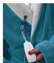
0 782 43

Parts used for calling a nurse Information report on door unit and control unit for nurses' station Compatible with all Legrand nurse call systems