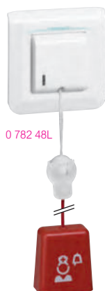
0 782 48L