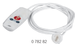
0 782 82