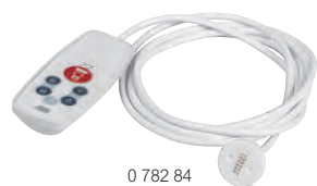
0 782 84