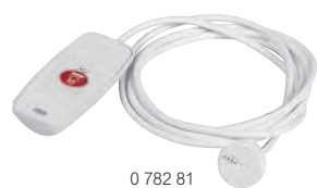
0 782 81

Compatible with all Legrand nurse call systems