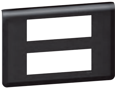
0 790 76L