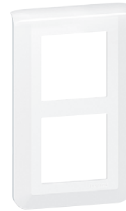
0 788 54L

Selection chart for boxes, supports and plates p. 1198-1199