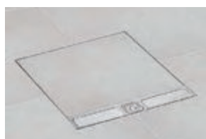
6 896 51 + 0 896 04