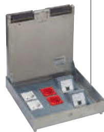
6 896 51 equipped with Arteor mechanisms

Technical characteristics p. 1158 to 1160