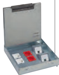
6 896 56 equipped with Arteor mechanisms