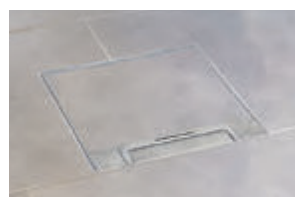
6 896 56 + 0 896 04