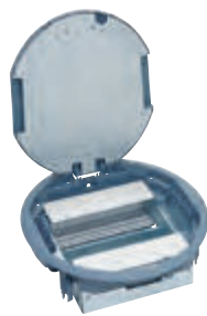
0 881 27