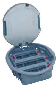
0 881 26