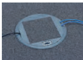
0 881 27 with carpet