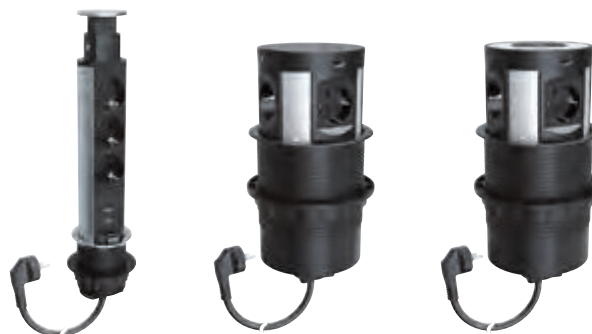
6 549 74