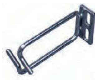
6 466 69