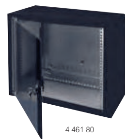
4 461 80