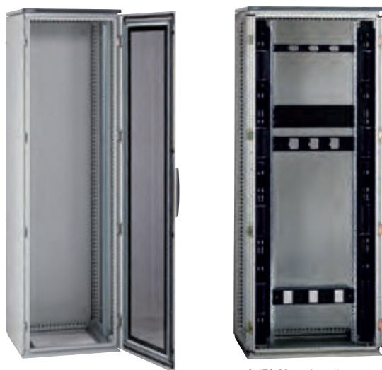
0 473 62 + 0 472 72 + 0 482 20