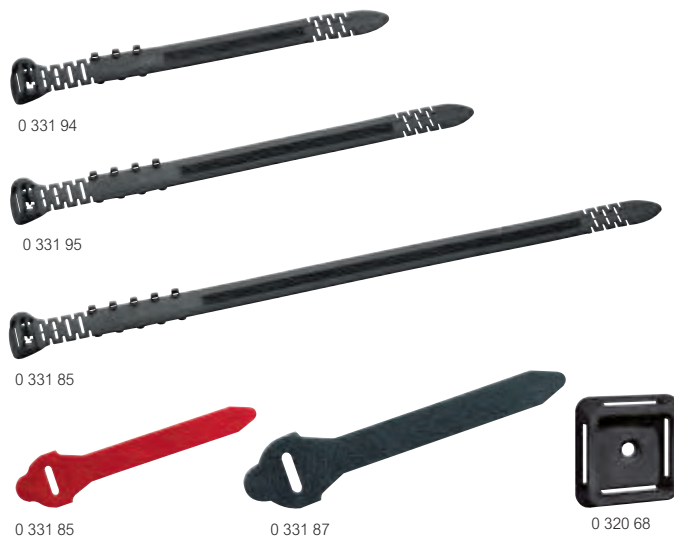
0 331 94