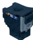
6 329 08