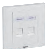
6 327 95