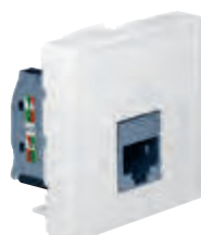
6 329 01