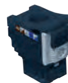
6 329 11