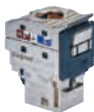
6 329 05