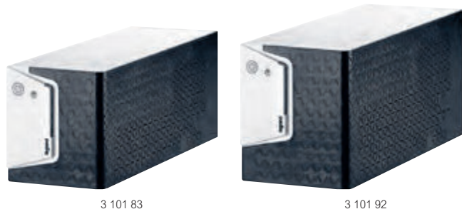
3 101 83