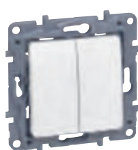
7 645 09