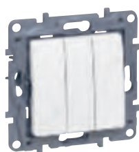
7 645 03