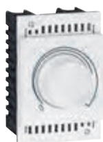
5 735 01