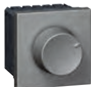
5 727 13