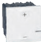
5 722 39A

Support frame and plate selection charts p. 594-603 Load selection charts p. 564