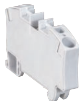
0 372 63