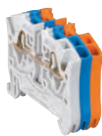
0 372 60 + 0 372 00 + 0 372 20