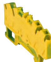
0 372 79

Technical characteristics p. 467 Dimensions p. 468