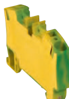
0 372 72