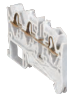
0 372 40