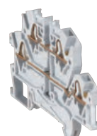
0 372 67