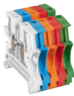
0 371 61 + 0 371 01 + 0 371 21 + 0 371 31 + 0 371 77