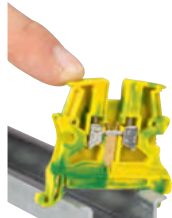
0 371 70 on rail