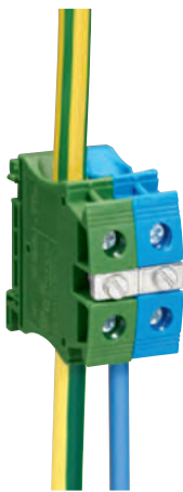
TN-C-S earthing schema PEN separation 0 371 98 + 0 371 04 + 0 375 42