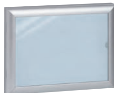
0 475 45