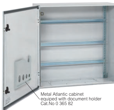
Metal Atlantic cabinet equipped with document holder Cat.No 0 365 82