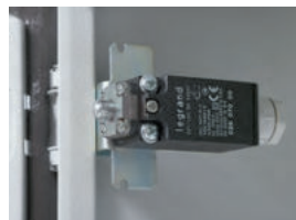
0 363 13