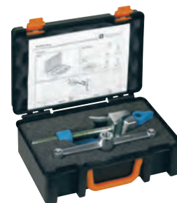
0 364 45

Cabinet and equipment selection chart p. 414-415 Technical characteristics p. 437