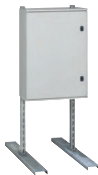
0 362 56 on stand Cat.No 0 364 36 and cross-pieces Cat.No 0 364 39