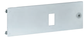
0 212 13