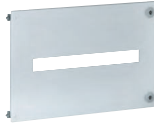
0 212 11