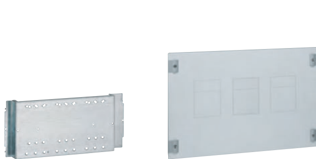
0 206 20

1: Hinges Cat.No 0 209 59 available as an option