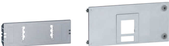
0 213 09