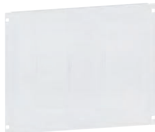
3 374 54