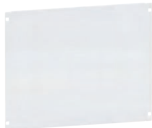
3 387 74