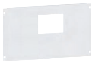
3 374 58