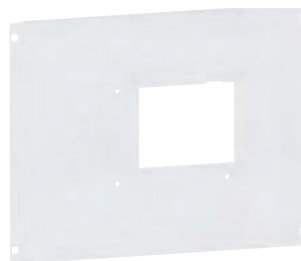
3 374 44

Selection chart p. 344 to 353 Installation principle p. 368