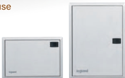
Single-phase + neutral

The same cabinet can be flush or surface mounted (easier choice and only few catalogue numbers to store).