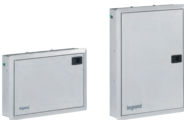
4 025 08