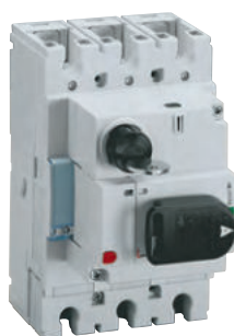
4 210 00