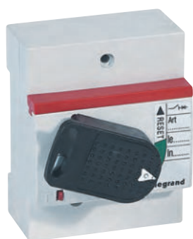
0 271 78