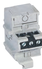
0 271 40