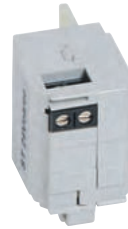
0 271 51