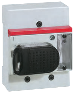
0 271 76