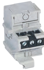
0 271 40