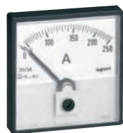
0 146 00 + 0 146 16