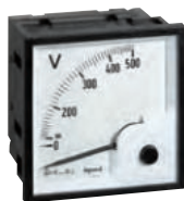
0 146 61