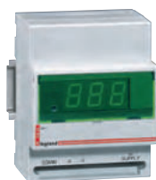
0 046 63