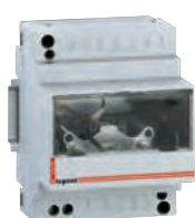
0 046 00