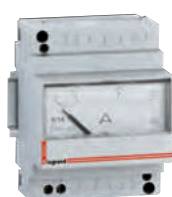
0 046 02