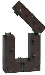
4 121 62