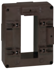
4 121 42