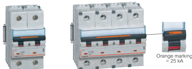
4 097 72

thermal magnetic MCBs from 2 A to 125 A - C and D curves