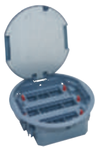
0 881 26