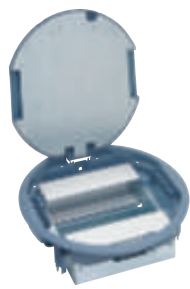
0 881 27