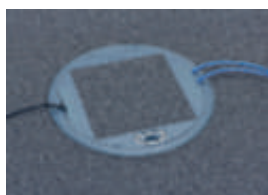
0 881 27 with carpet