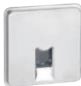
0 778 91