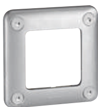
0 778 51