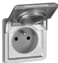
0 778 31