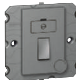
5 726 50