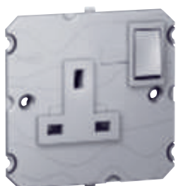
5 710 48