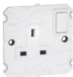
5 721 43