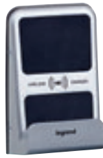
0 775 99

Wireless power chargers for fast charging a smartphone with a Qi receiver Power supply standby mode consumption < 0.07% Conform to the Qi WPC standard (Wireless Power Consortium): certified for professional Qi 1.2.3 projects Conform to EN 62479 standard (EMF emissions) Conform to ICNIRP specifications (health protection) Do not interfere with other wireless signals (Zigbee, TNT, GSM, 4G, etc)