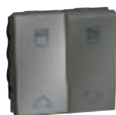
5 737 22