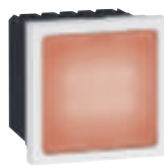
5 722 24