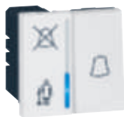
5 720 57