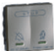
5 725 54