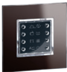
0 675 92 + plate Reflective Black 5 713 82