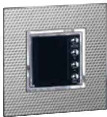
0 674 59 + plate Cube 5 714 02