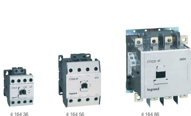
4 164 36