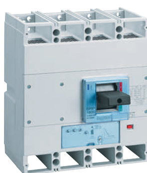
4 225 59

S1 electronic release MCCBs from 630 to 1600 A