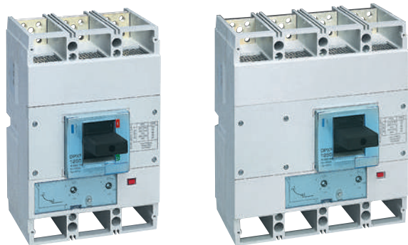
4 222 78

thermal magnetic release MCCBs from 630 to 1250 A