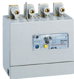
0 260 63