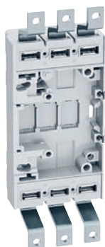
4 222 22