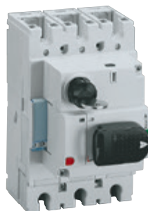
4 210 00