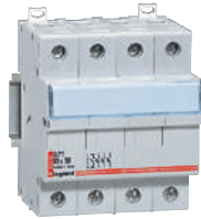
0 058 48