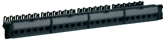
0 335 52