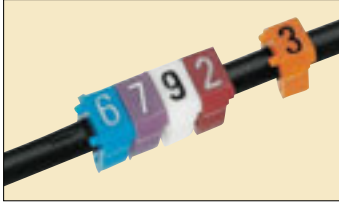
Perfect alignment of label holders